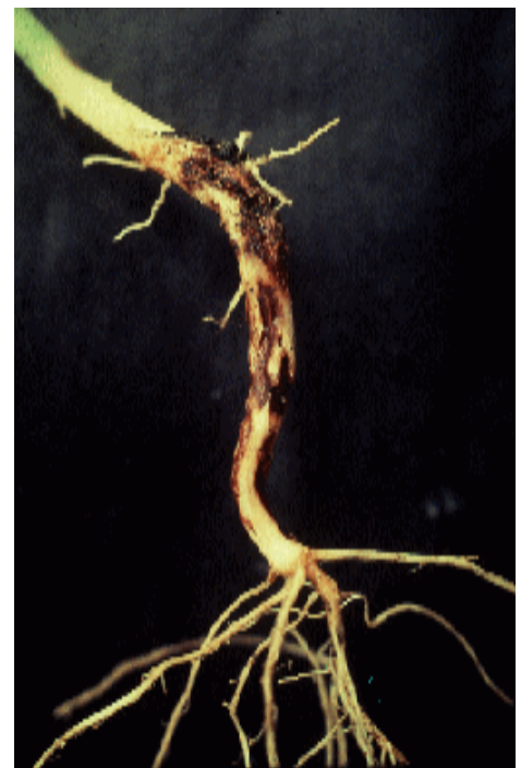
Figure 4: Rhizoctonia lesions and microsclerotia.

It must be emphasized that crop management will be most successful if the producer integrates the recommended strategies of crop rotation, planting date, planting rate, seedbed preparation, certified seed, fungicide treatments, herbicide and cultivation practices, and irrigation procedures.